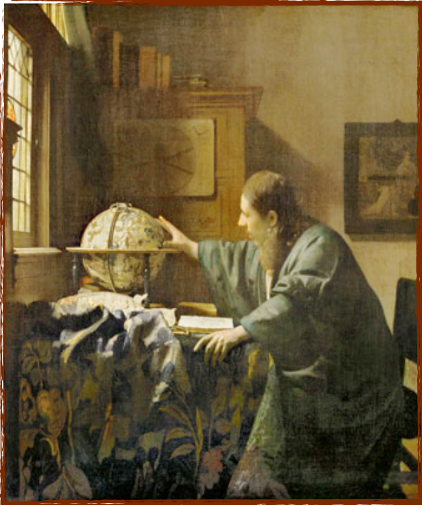
Johannes Vermeer, Dutch, 1632-1675

Venture to a virtual France to enjoy art spanning 4,000 years.